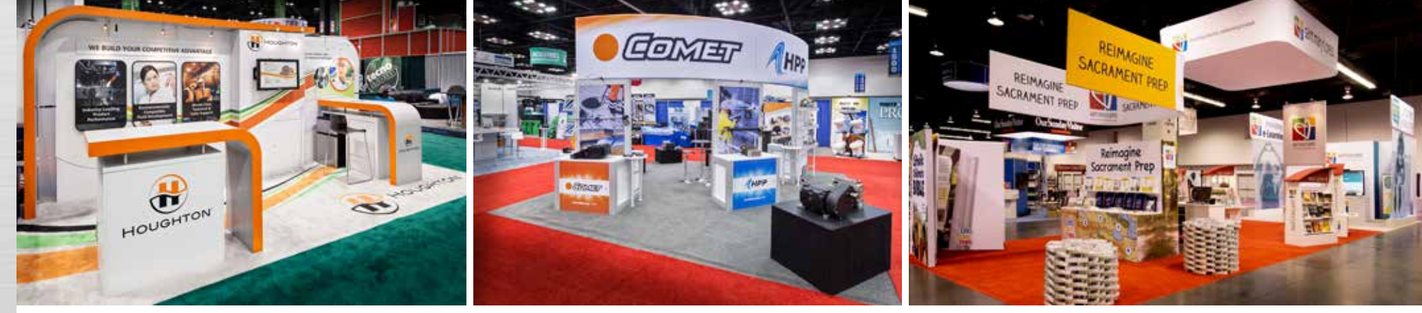
Inline exhibits are typically 10' x 10' or 10' x 20' where only one or two sides are exposed to trade show aisles.