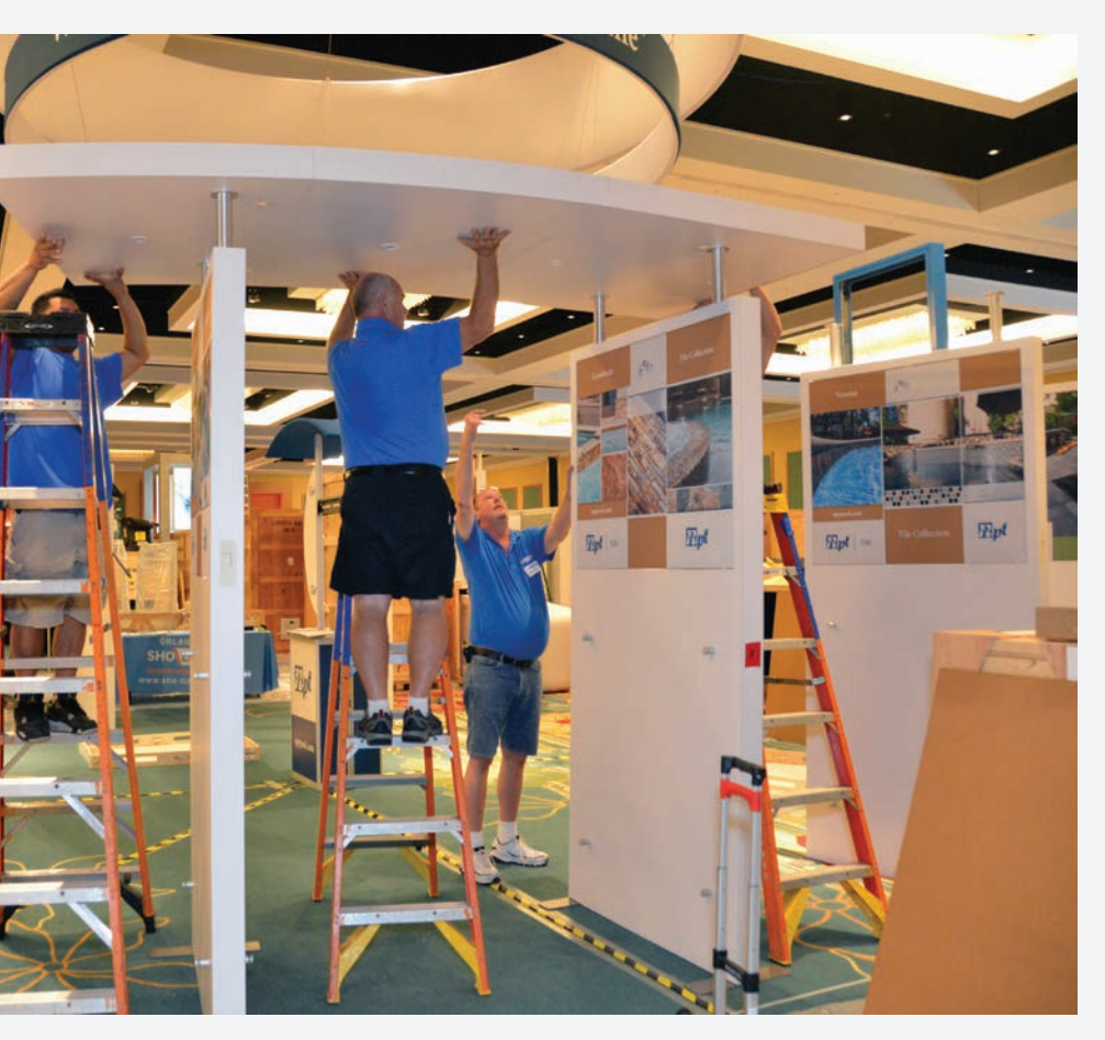
Exhibit installation & dismantle

Shipping to the advanced warehouse is the most cost effective way to transport your exhibit. Advanced warehouse is an off-site warehouse where exhibitor freight is stored until show set-up begins. Shipping to the advanced warehouse ensures that your materials are secure and guarantees that the materials will be moved to your booth space before installation teams arrive. You also reduce costlier risks, such as marshalling yard fees and overtime installation charges if the booth materials are late. The window of time in which materials may arrive at the advanced warehouse is typically 45-60 days before a show.